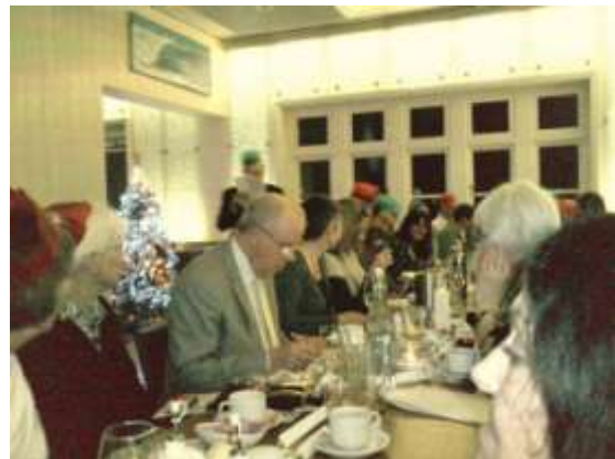
Quizzical diners after stuffing their Christmas stockings with nosh.